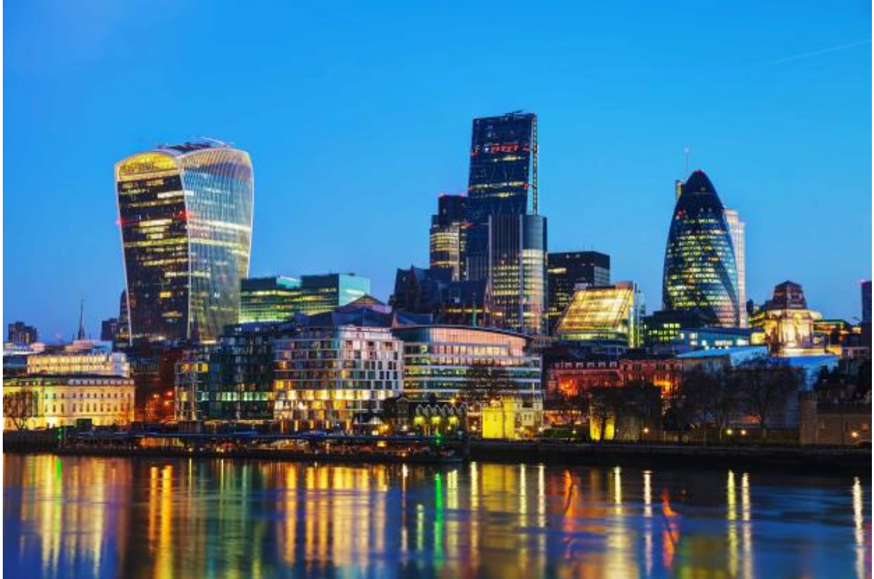
Autumn 2- Bright Lights Big City