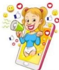
A Parent's Guide to Online Influencers