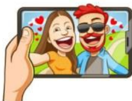
A Parent's Guide to Sharing Pictures