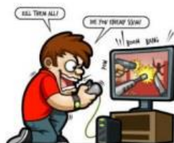
A Parent's Guide to Gaming