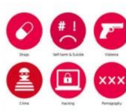
A Parent's Guide to Privacy Settings

Online safety is when young people know who they can tell if they feel upset by something that has happened online.