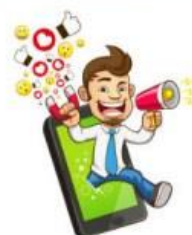
A Parent's Guide to Live Streaming