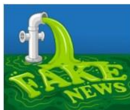
A Parent's Guide to Fake News