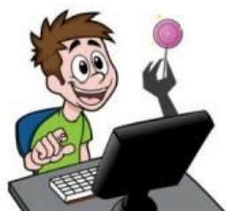
A Parent's Guide to Online Grooming