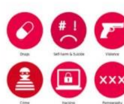
A Parent's Guide to Privacy Settings

Online safety is when young people know who they can tell if they feel upset by something that has happened online.