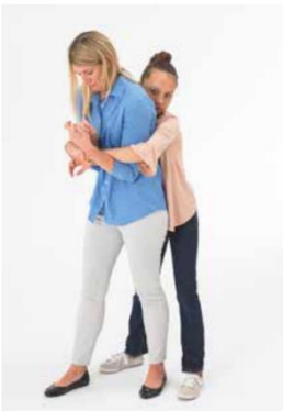
High level body disengagement (lever)