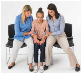
Young person (KS2) medium level restriction in a seated position