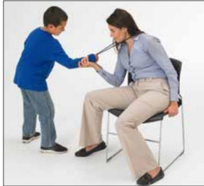
Low level neck disengagement (hold and stabilise)