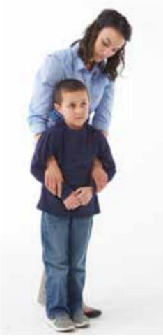
Young child (EYFS and KS1) medium level restriction in a standing position