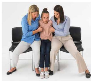
Young person (KS2) high level restriction in a seated position