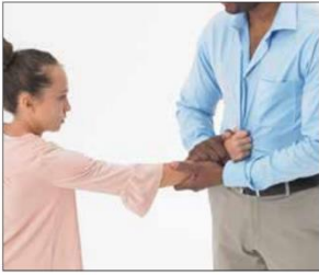
Low level clothing disengagement (hold and stabilise)