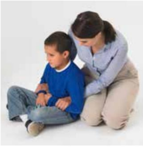
Young child (EYFS and KS1) medium level restriction in a seated position on the floor