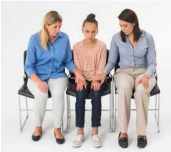
Young person (KS2) low level restriction in a seated position