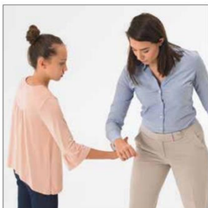
High level wrist/arm disengagement (lever)