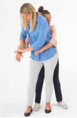
Medium level body disengagement (push/pull)