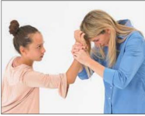
High level hair disengagement (lever)