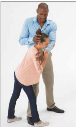
Low level bite disengagement (hold and stabilise)