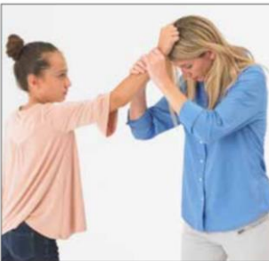
Low level hair disengagement (hold and stabilise)