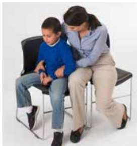
Young child (EYFS and KS1) medium level restriction in a seated position