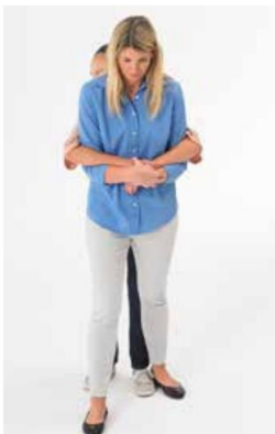
Low level body disengagement (hold and stabilise)