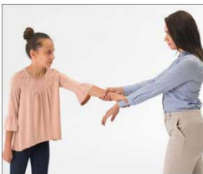
Low level wrist/arm disengagement (hold and stabilise)