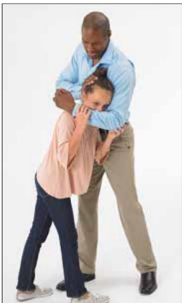
Medium level bite disengagement (push/pull)