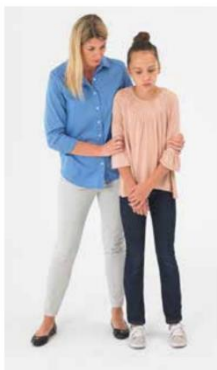
Young person (KS2) low level restriction in a standing position