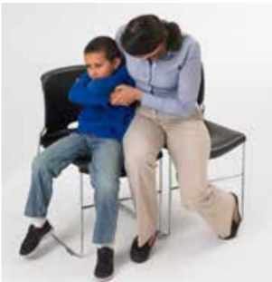
Young child (EYFS and KS1) high level restriction in a seated position