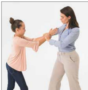
Medium level neck disengagement (push/pull)