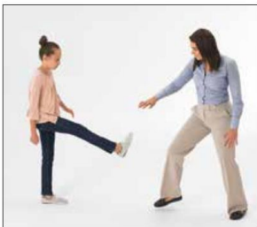
Block and move for a lower body strike