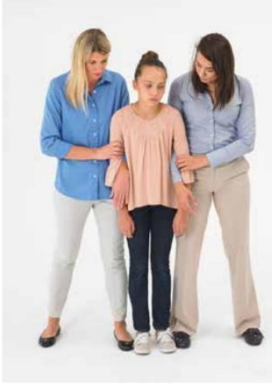
Young person (KS2) medium level restriction in a standing position