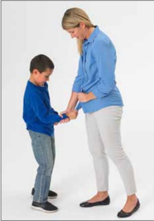
Medium level clothing disengagement (pull/push)