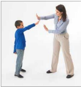
Block and move for an upper body strike