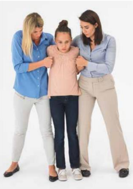
Young person (KS2) high level restriction in a standing position