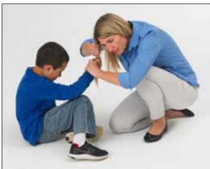
Medium level hair disengagement (push/pull)