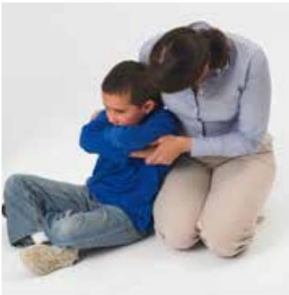
Young child (EYFS and KS1) high level restriction in a seated position on the floor