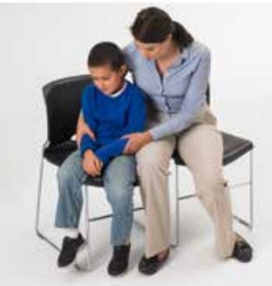
Young child (EYFS and KS1) low level restriction in a seated position