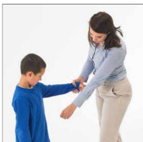
Medium level wrist/arm disengagement (pull/push)