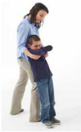
Young child (EYFS and KS1) high level restriction in a standing position