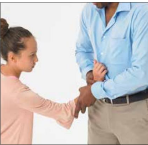
High level clothing disengagement (lever)