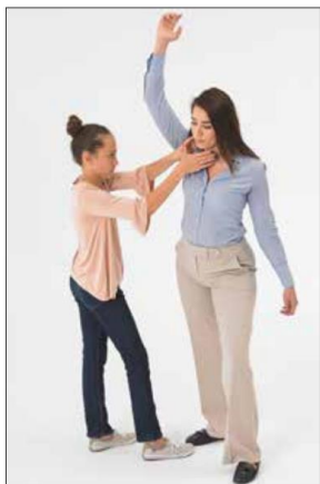
High level neck disengagement (lever)