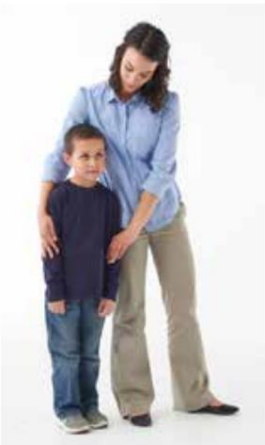
Young child (EYFS and KS1) low level restriction in a standing position