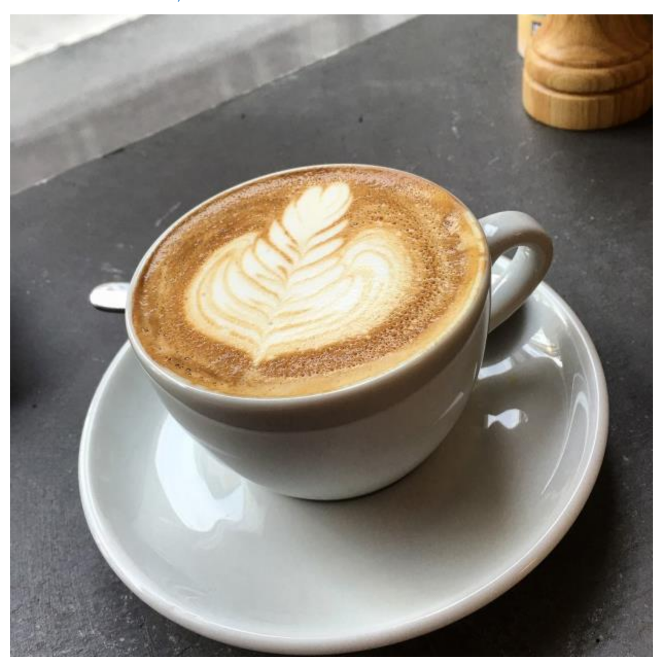
Reminder - Enderby Events

Please have a look below for the events happening in Enderby: