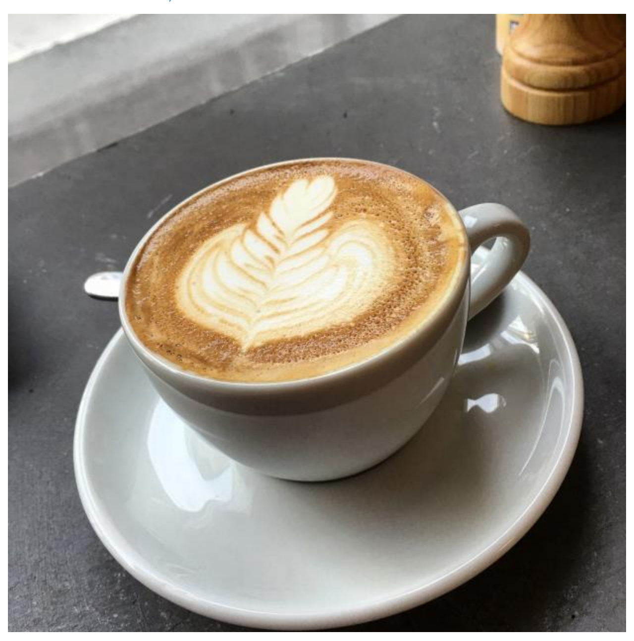
Reminder - Enderby Events

Please have a look below for the events happening in Enderby: